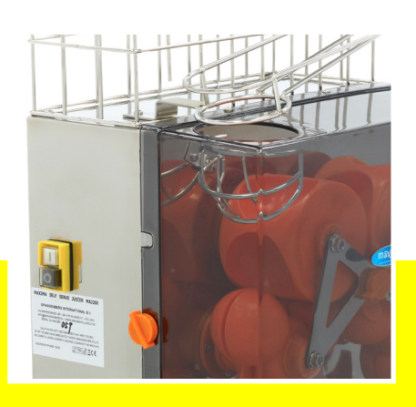
Anticorrosive press parts and on-off switch on the side