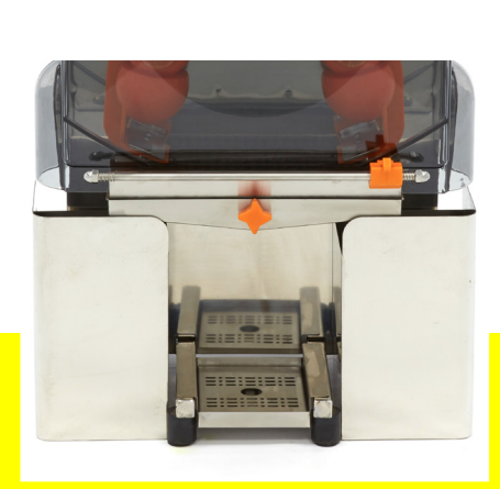
Stainless steel housing, with a maximu bottle / glass height of 16 cm