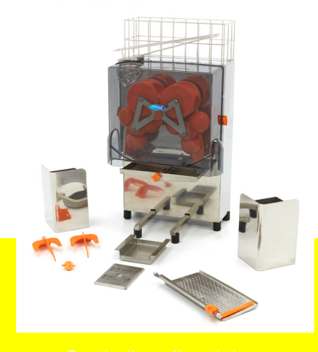
Easy to dismantle and clear